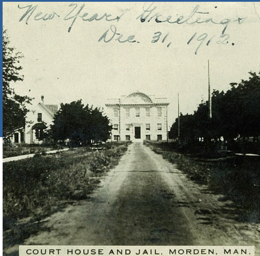
COURT HOUSE AND JAIL, MORDEN, MAN.